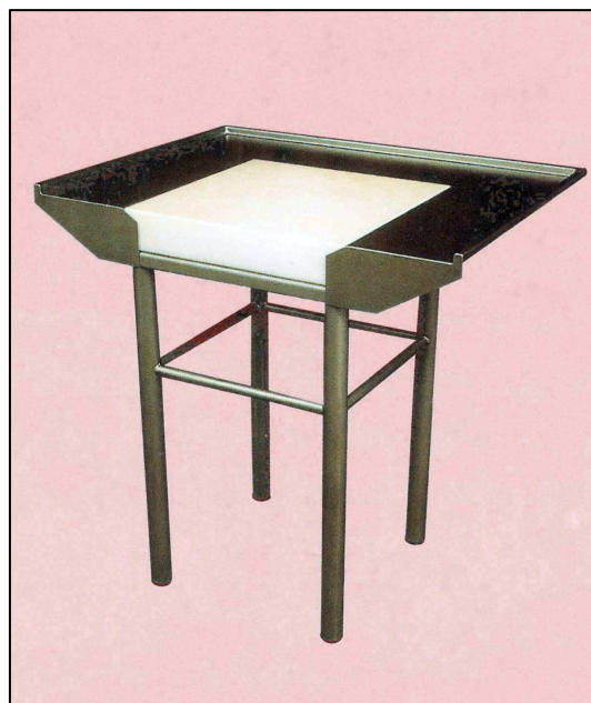
MEAT CUTTING BLOCKS type 845A